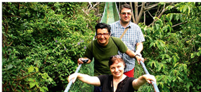
Program directors from Butler University and Valdosta State University

Studying abroad is a wonderful experience from a personal and professional point of view. It's a way to excel beyond hundreds of professionals that graduate every year and the perfect opportunity to learn a new language. That being said, we encourage faculty members all over the world to participate in these priceless programs. Besides the language portion, there are several advantages that can be mentioned for studying abroad that you, as a teacher, don't want your students to miss: